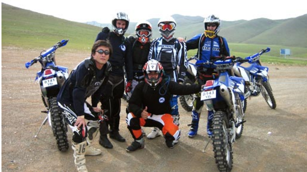
Mongolians stopped to stare at this bunch of motorcyclists

Day 1 Arrive Ulaanbaatar. Transfer to Continental Hotel.