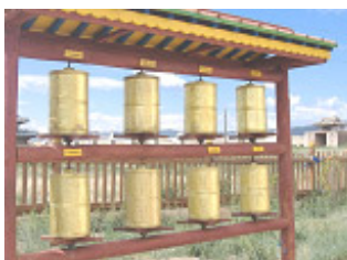
Prayer wheels at Erdene Zuu

Day 6 Set out of the city by jeep into the vast open countryside. Afternoon arrive at Khogno Khaan. Evening explore the area around the dramatic granite