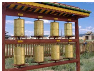
Prayer wheels at Erdene Zuu

Day 6 Set out of the city by jeep into the vast open countryside. Afternoon arrive at Khogno Khaan. Overnight ger camp at the foot of the mountain.