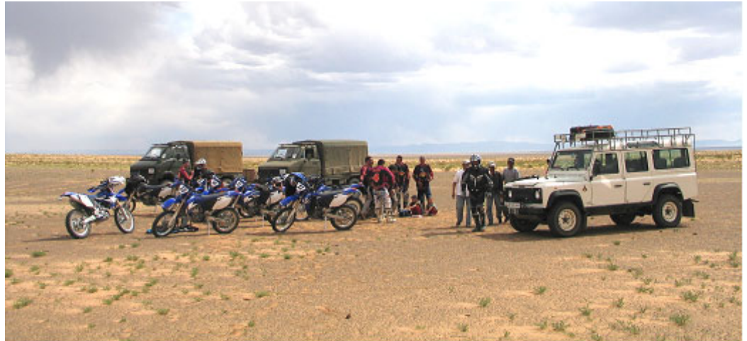
Motorbikes and Support Group

Day 1 Arrive Ulaanbaatar. Transfer to hotel near to the city centre. Allocate motorbikes and meet the tour crew. Overnight hotel.