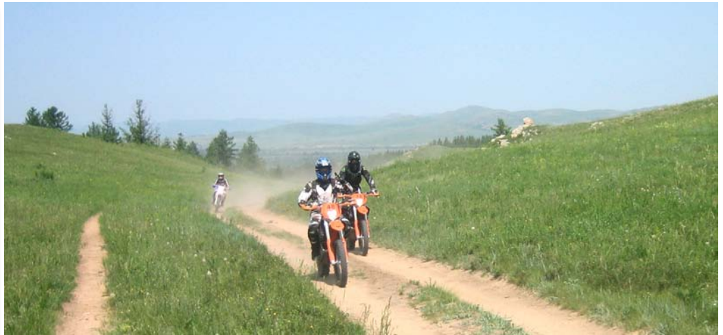
Binder Mountain Pass

Day 1 Arrive Ulaanbaatar. Transfer to hotel near to the city centre. Allocate motorbikes and meet the tour crew. Overnight hotel.